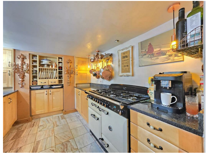
Kitchen 8'8" x 9'7" (2.65m x 2.93m)

Windows to rear, marble tile floor with underfloor heating, fitted base units with blue pearl granite worktops and matching upstand, space for Range style cooker, inset Belfast sink, integrated dishwasher.